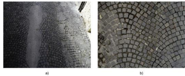
Figure-2. Image captured with an RGB sensor on an articulated pavement.

in the image taken with an RGB sensor on an articulated pavement.